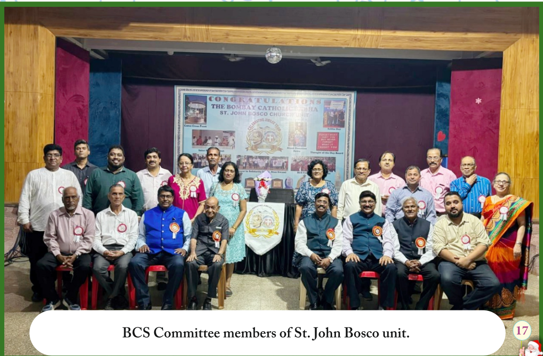
BCS Committee members of St. John Bosco unit.